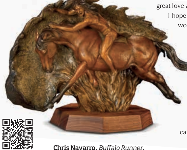
bronze, 17 x 28 x 7"

"I would encourage art lovers to attend the event because it's a collection of world-class